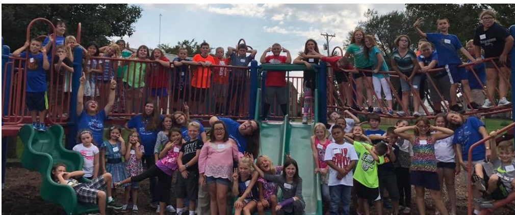
2017-2018 West group picture, just having a little bit of fun!